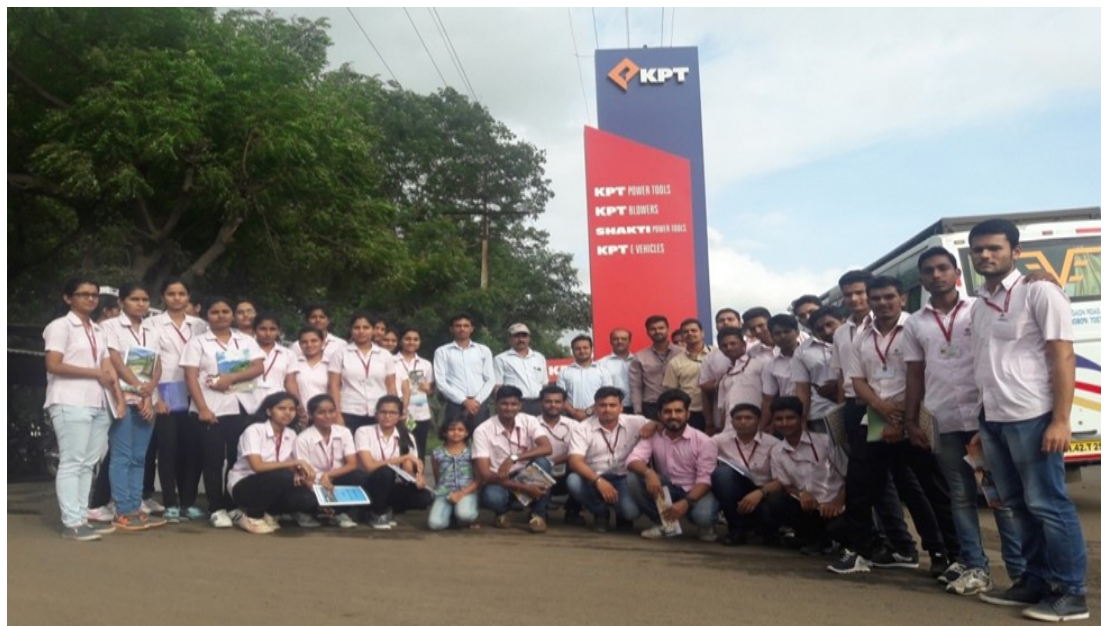
Faulty members and students during the Industrial Visit