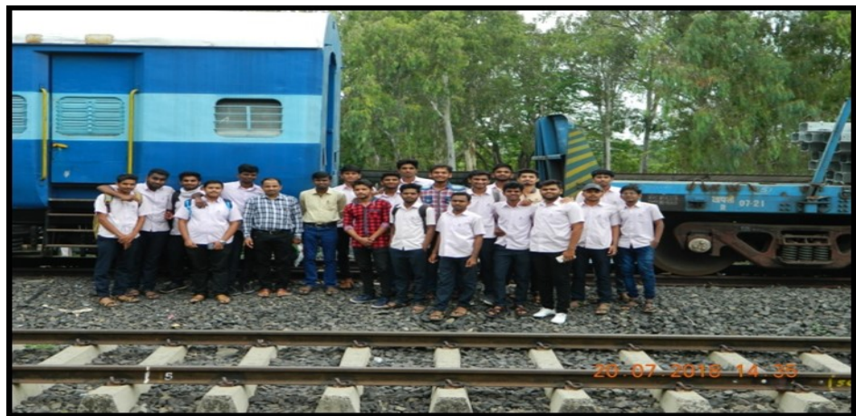
Students and Faculty members at Baramati Railway Station