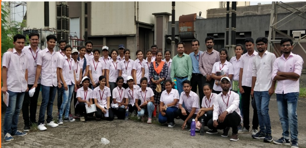
Faculty Members and Students at HVDC Transmission Substation in Padghe