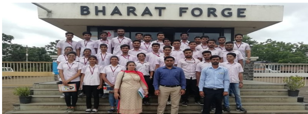
Faculty members and along with students at Bharat Forge