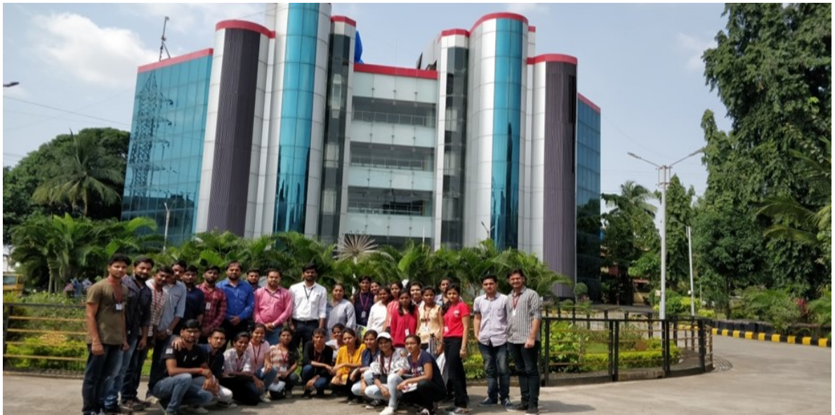
Students and Faculty Members during the Industrial Visit at SLDC Kalwa in Thane