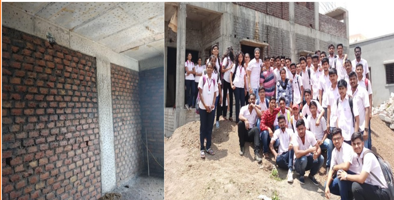
Students and Faculty members during the visit