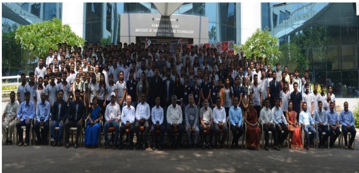
Hon. Principal, Vice-Principal, Faculty Members and students in the Event