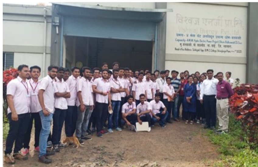
Faculty members along with students during the visit

Where there is integrity, there will be trust. Where there is trust, there will be an atmosphere for success.