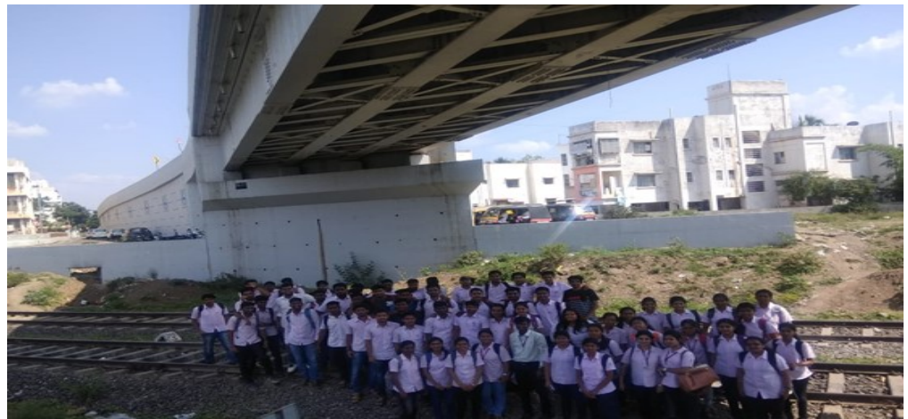
Faculty members and students during the industrial visit