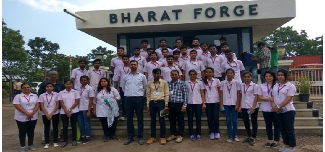
Faculty members and students during the industrial visit