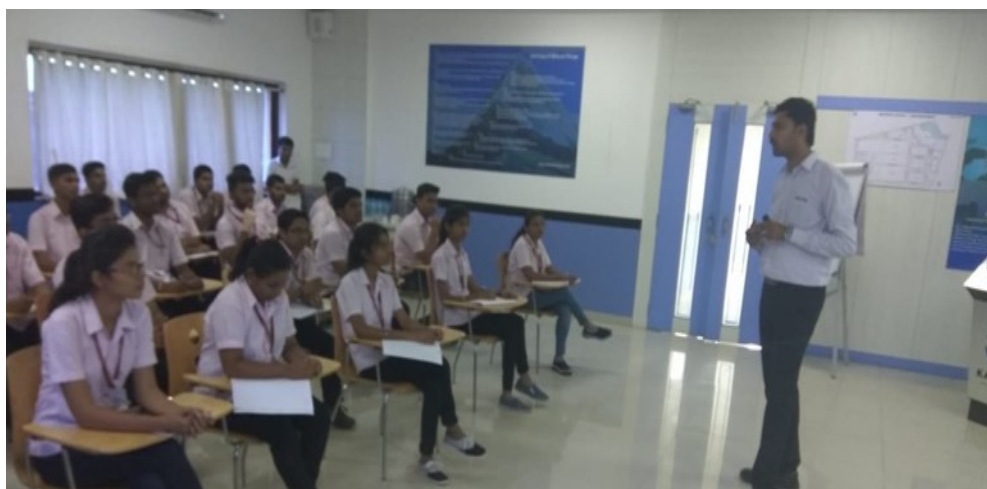
Students during interaction with the officer at Bharat Forge