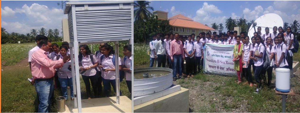
Students and Faculty Members during the Visit to Krishi Vigyan Kendra at Sharda Nagar in Baramati