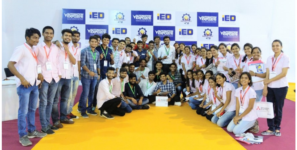
Faculty members and students during the Education Visit to Automation-Expo 2018, Bombay Exhibition Center in Mumbai