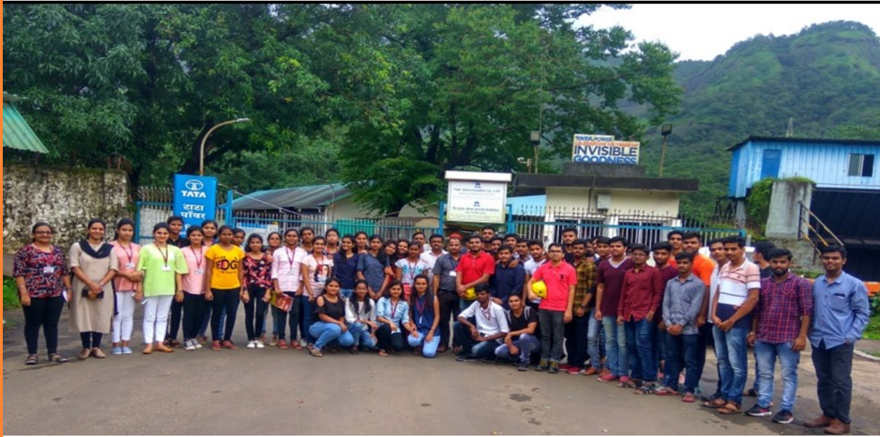
Students and Faculty members at Hydroelectric Power Plant