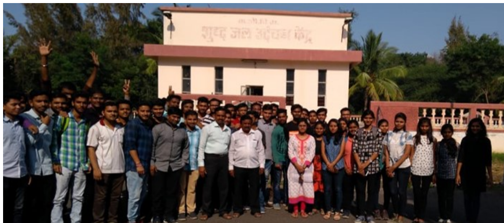
Faculty members along with students during the Visit

• Department of Mechanical Engineering organised an industrial visit to Water Treatment Plant, E and M Sub-division at MIDC in Baramati. The Visit was organized on 27 September 2018. Third Year students along with faculty members visited the Water Treatment Plant. They studied water filtration unit and also the pumping station. Ms. Mona Yadav coordinated the visit along with the technical staff.