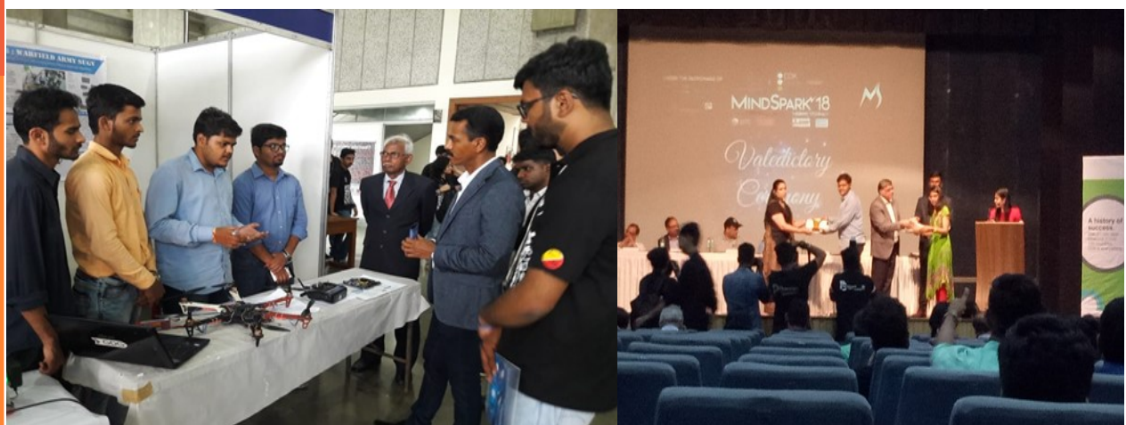
Students at Technical Exhibition at COEP

They are BE students from Electronics and Telecommunication Engineering Department. They participated in Technical Exhibition, i.e. Mindspark which was conducted by College of Engineering in Pune. They won the Prize of Rs. 25000 in this Technical Exhibition.