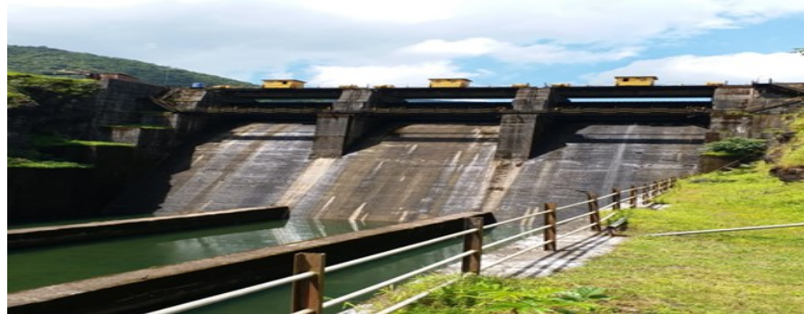
Dhom-Balkawadi Dam (Hydro-Electric Power Project)