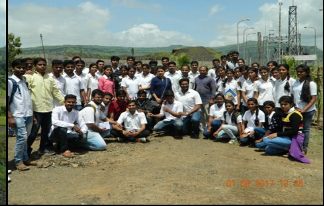
Hydroelectric Power plant and students with officers at site