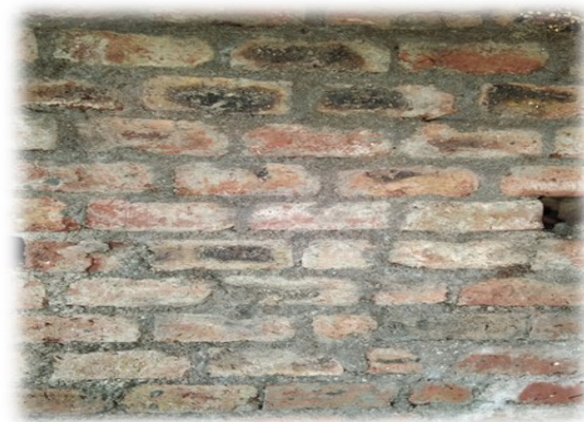
Brickwork on site in Stretcher Bond