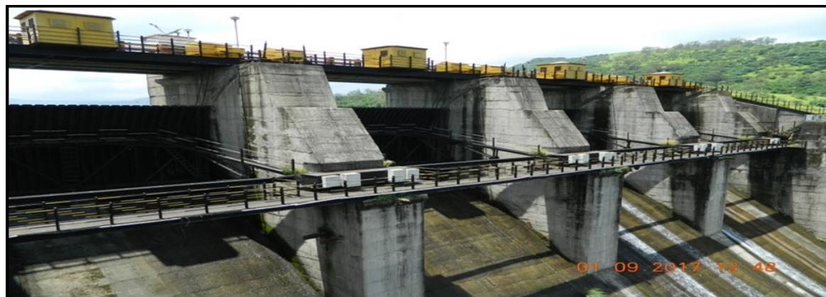
Project of Urmodi Dam