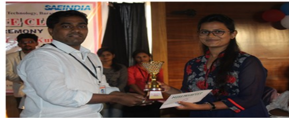
Participants and Faculty Members during the Event

• Department of Electronics and Telecommunication Engineering organised a One-Day Program on account of Engineer's Day. This program was organised on 15 September 2017. This program was organised in association with EESA under the banner "ELECTROVAGENZA". Main events organised under ELECTROVAGENZA were as follows.