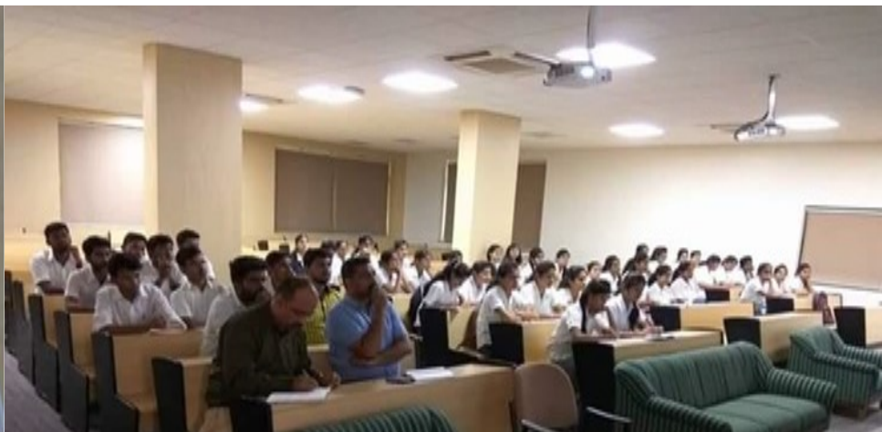
Students and Faculty members during the Seminar