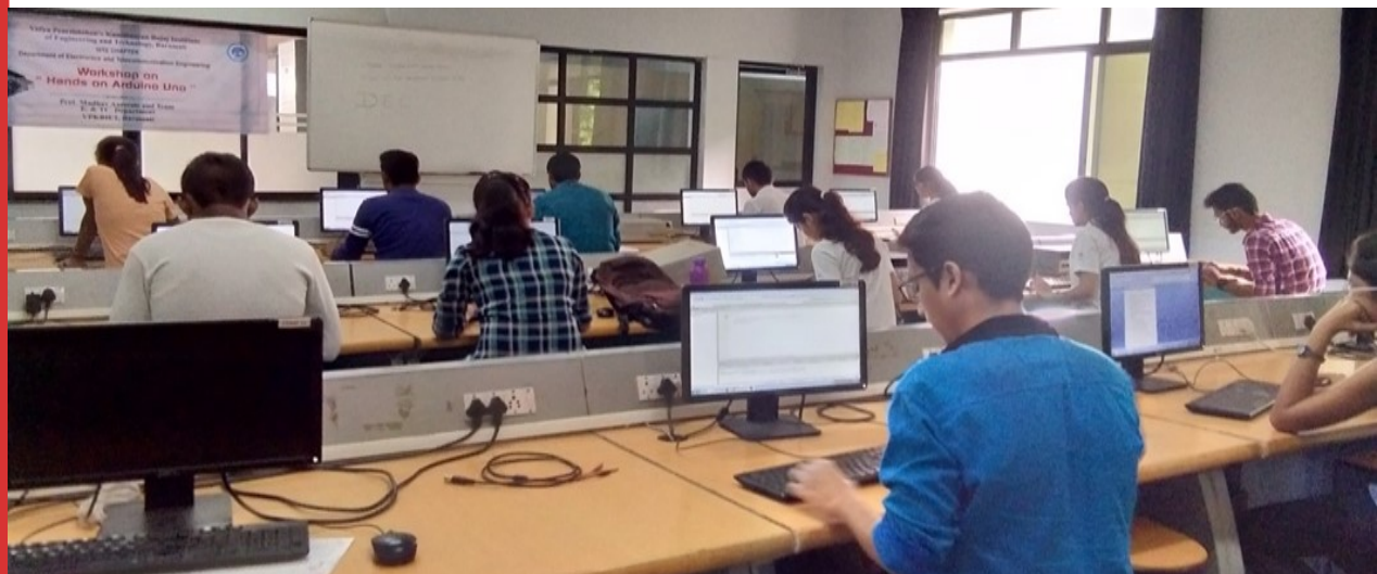
Students during the Activities in the Program