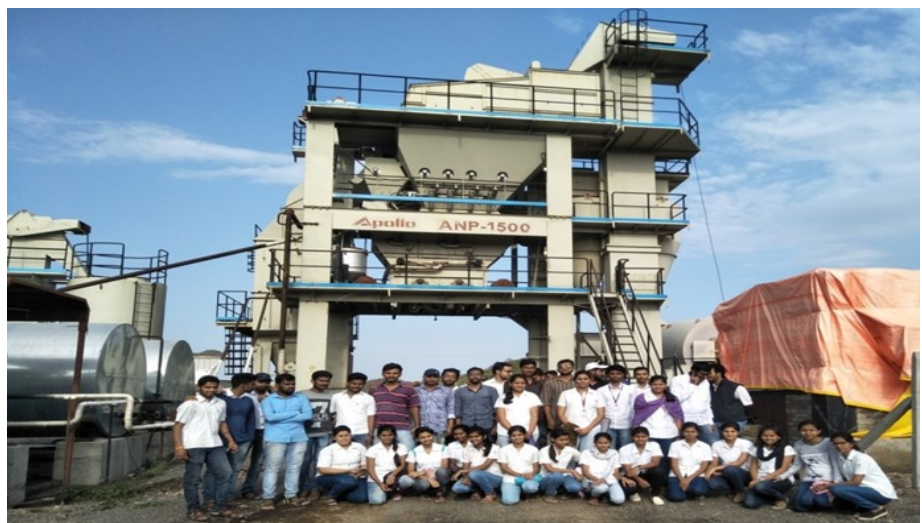
Students and faculty members during the Visit

• Department of Civil Engineering organised an Educational visit to Hot Mix Plant on 22 September 2017 for BE students. The Visit was coordinated by Prof. G N Narule for the subject Transportation Engineering. Students got an opportunity to visit Hot Mix Plant and gained knowledge of different aspects of bitumen and aggregate. Students studied and observed the complete process of mixing of bitumen with aggregates.