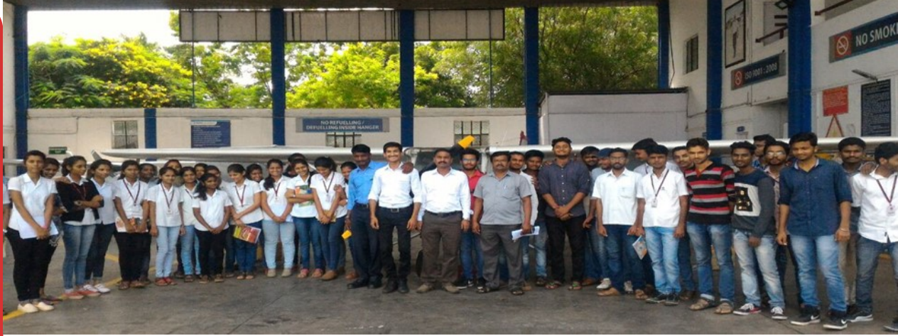
Students and Faculty Members at the Visit Place

"If a child can't learn the way we teach, maybe we should teach the way they learn." - Ignacio Estrada