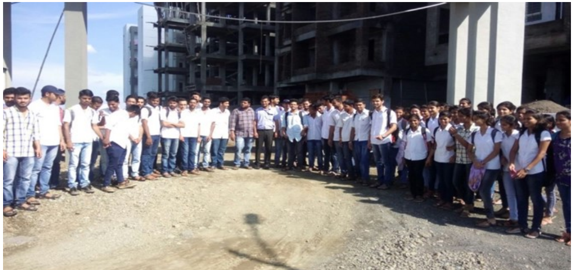
Students and Faculty Members during the Visit