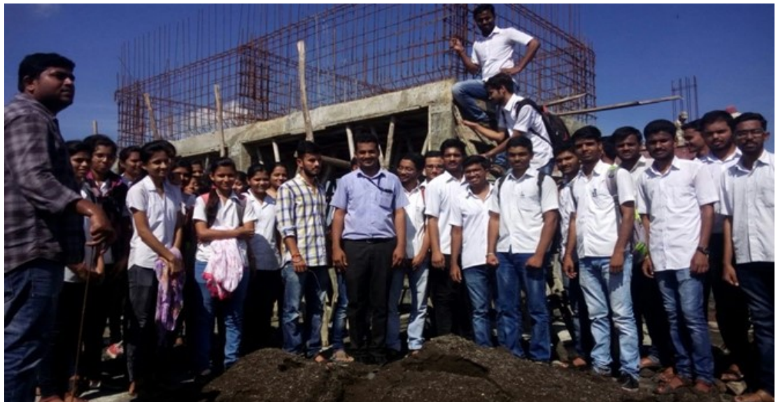
Students and Faculty Members at the Site