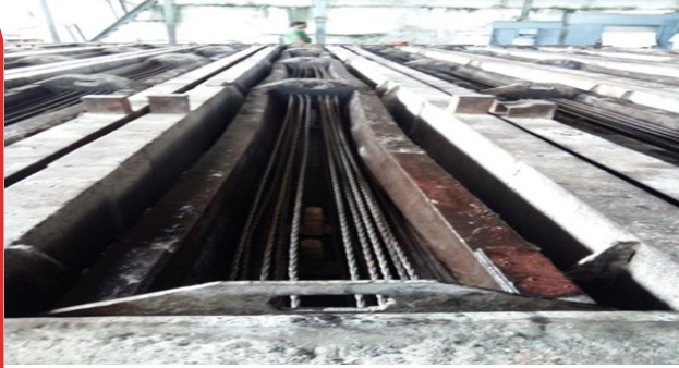
Pre-stressing of Cables