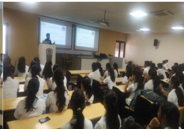
Students during the Seminar