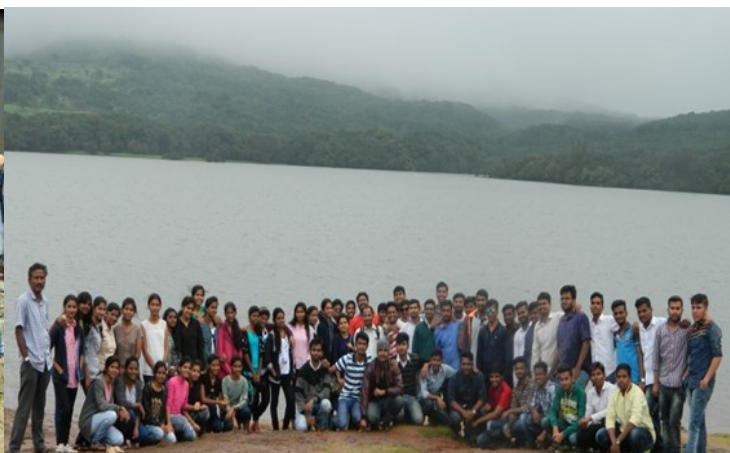
Students at Urmodi Dam Project with Faculty Members and Officers