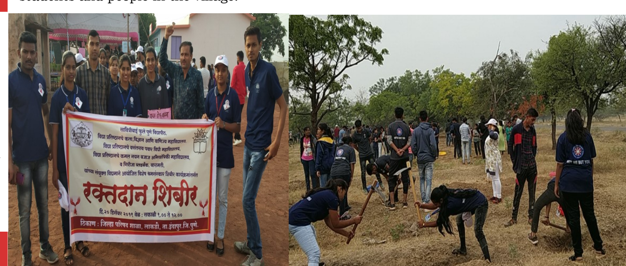
Faculty and Students during the NSS Special Camp

• The NSS Unit of our Institute organised a Seven-Day Special Camp for students. It was organised at Lakadi village. 225 NSS volunteers from Vidya Pratishthan's KBIET and other two colleges of Vidya Pratishthan participated in the camp. 7 groups of students were formed for planning everyday activities. The students cleaned the major part of the village and plated saplings. Awareness programs on Alcohol and Drugs were conducted. Various cultural programs, morning rally, street-plays and environmental awareness were organised for the students and people in the village.