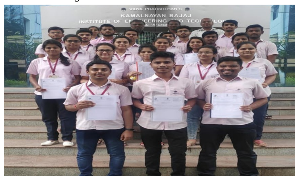
Faculty and Students involved in the Projects of Patents

These faculty members from Electronics and Telecommunication Engineering Department have filed 9 patents along with students' groups. Some of the projects include the titles like 'Design of Automatic Sugarcane cutter with Bud Detection' and 'Multipurpose Egg Hatching Machine'. These patents were filed in November 2019. Two projects of these faculty members have received incubation from Atal Incubation Centre at Agricultural Development Trust in Baramati. There are many students involved in these projects. Their photo is given below.