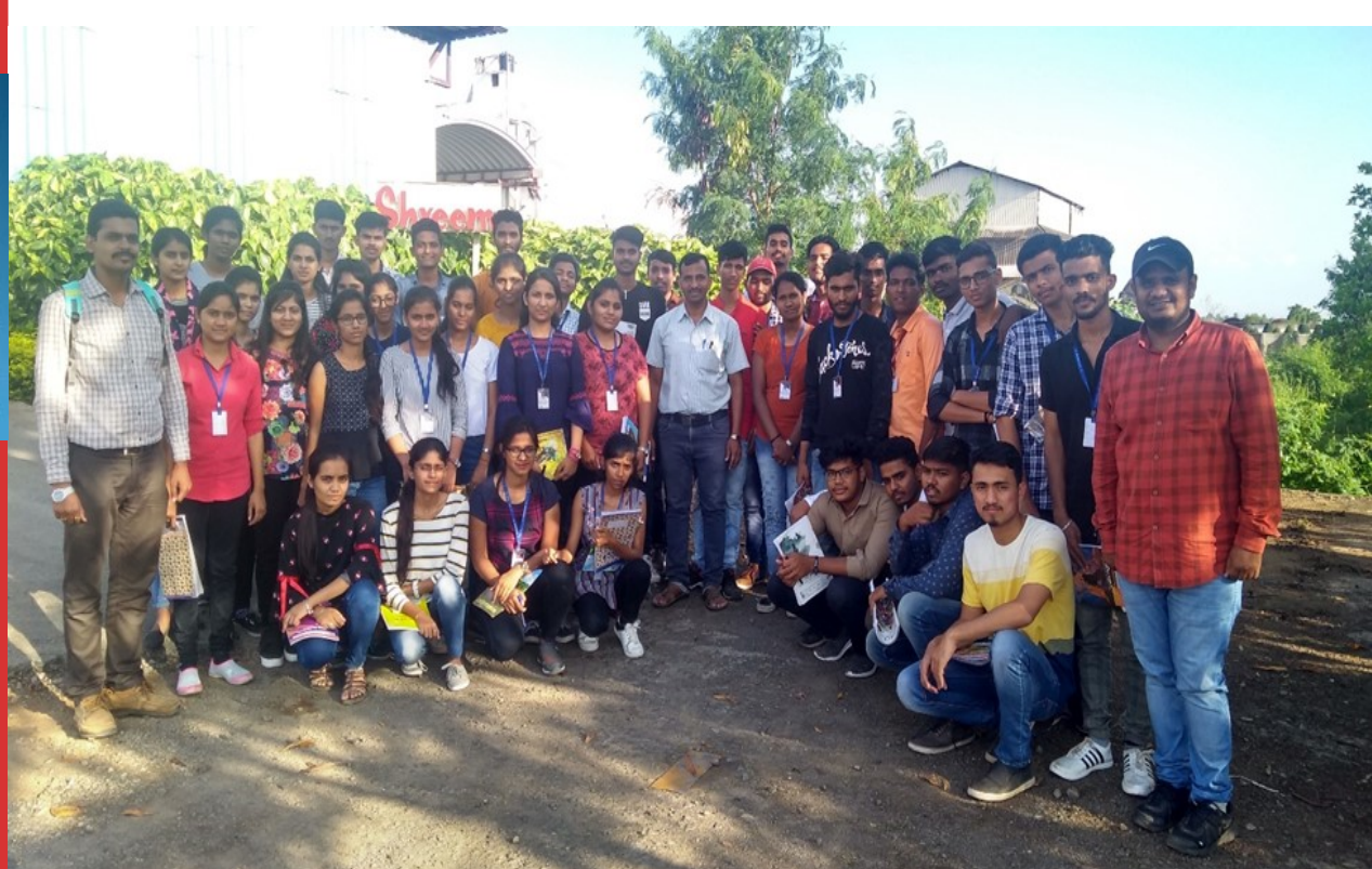
Faculty and Students during the visit

Education's purpose is to replace an empty mind with an open one. - Malcolin