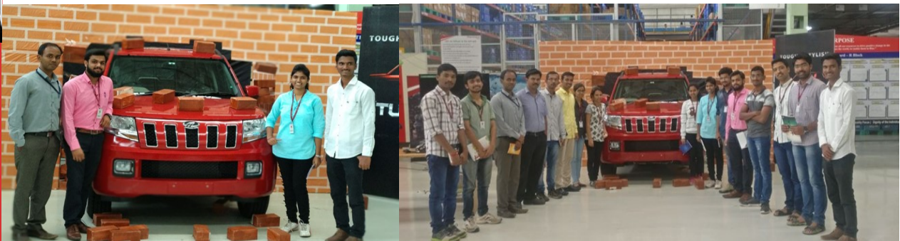
Students along with faculty members during the visit