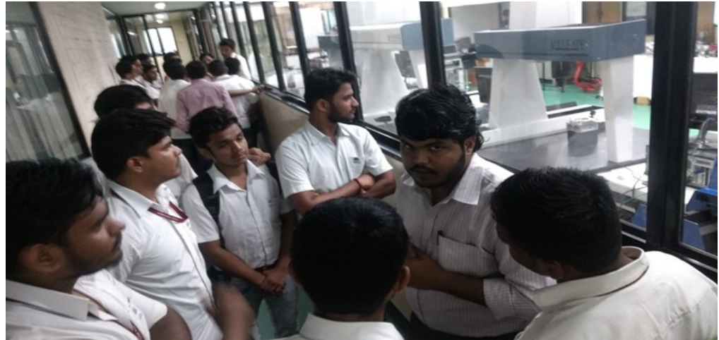
Students with the instructor at Accurate Sales and Services Pvt. Ltd.