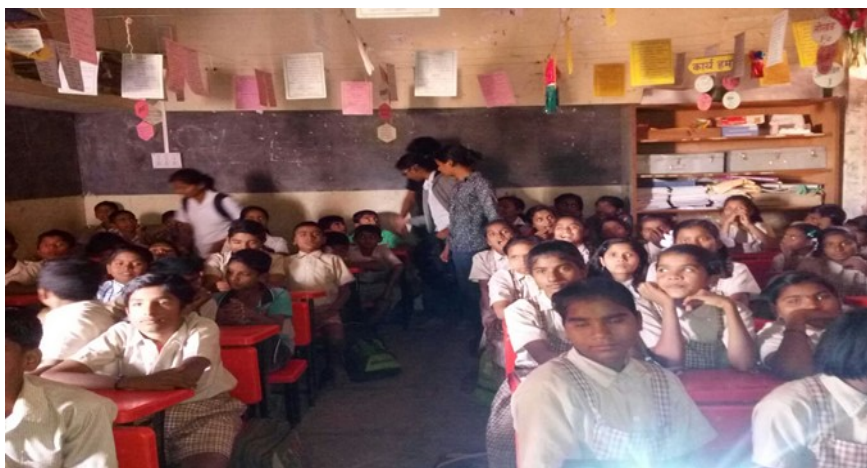
Faculty members and students in the lecture