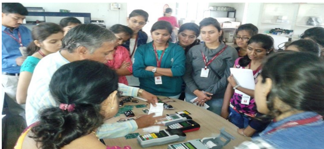
Expert from Aftek explains Handled PDA to the students and faculty members