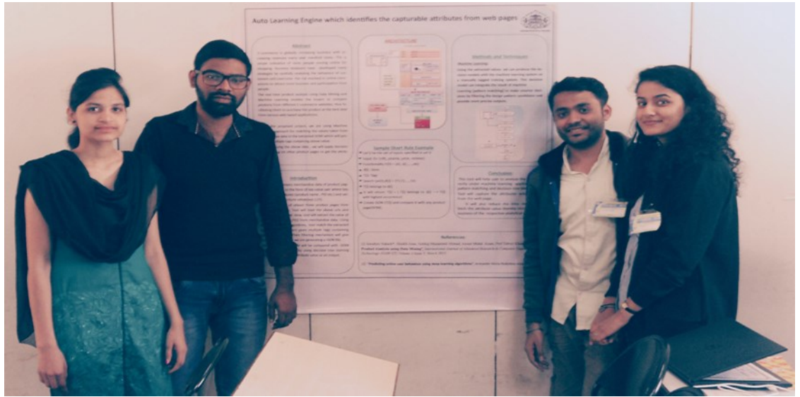
Students during their Project Competition