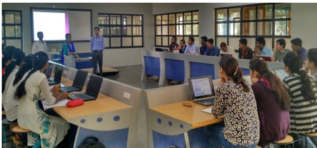
Faculty and students in the Workshop