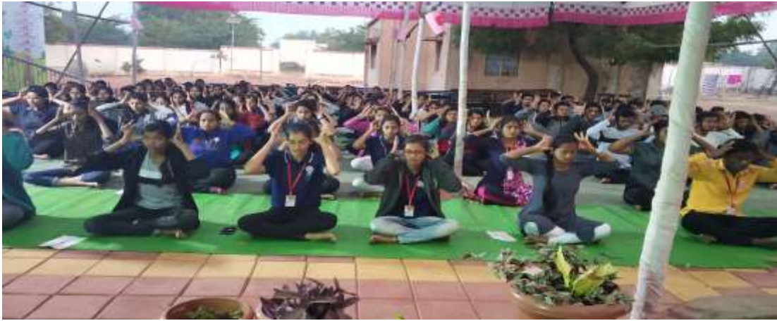
(Photo of NSS Students doing yoga )