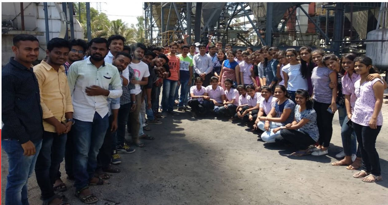
Students and Faculty members during the Visit