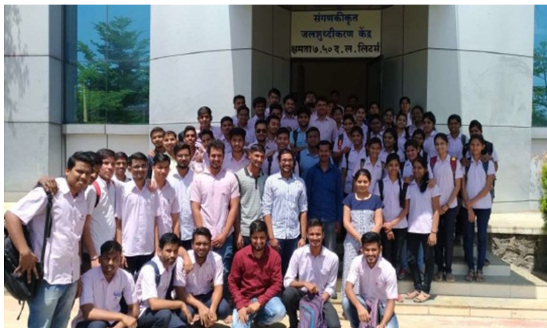
Faculty members and students during the Visit