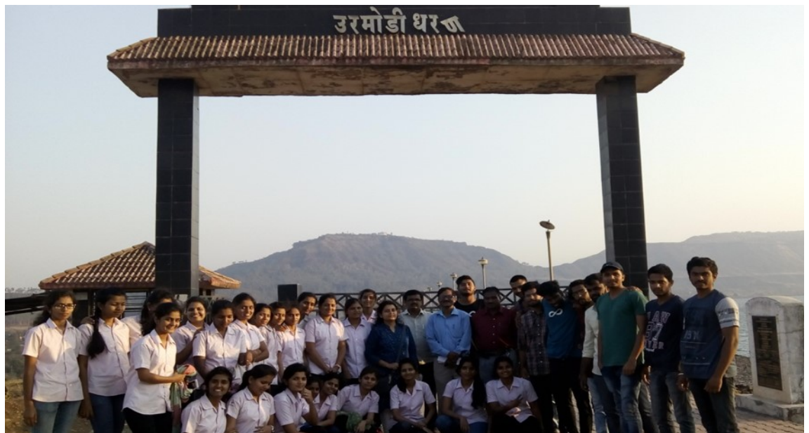
Faculty members and students during the Visit to Urmodi Dam