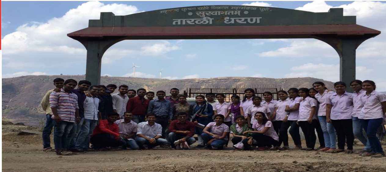
Faculty members and students during the Visit to Tarali Dam