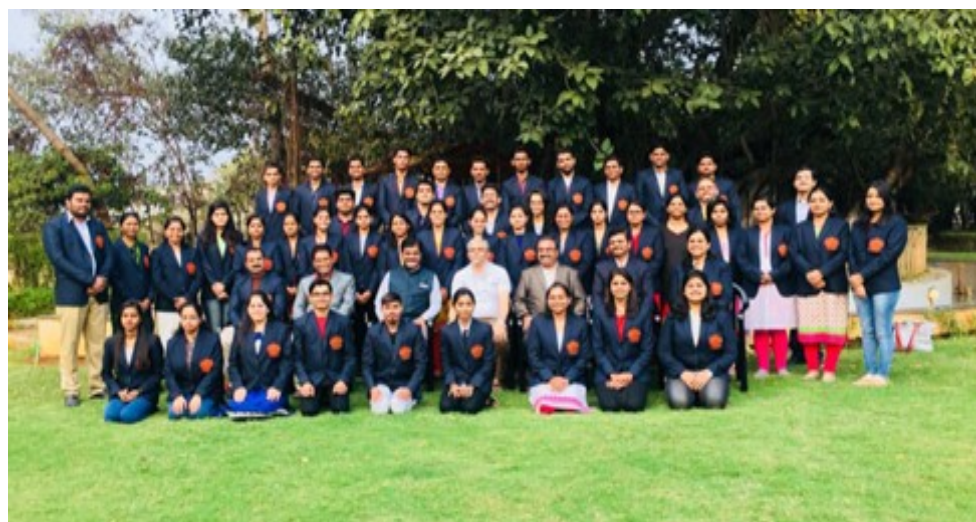
Pune University Team during AVISHKAR 2017

She participated in Teacher Category Team in AVISHKAR 2017. The Team won the university level round for Avishkar 2017. She represented Pune University through Teacher Category in Agriculture and Animal Husbandry discipline at 12th Maharashtra State Inter-University Research Convention (AVISHKAR 2017). The Competition was organised at Rahuri during 15 to 17 January 2018.