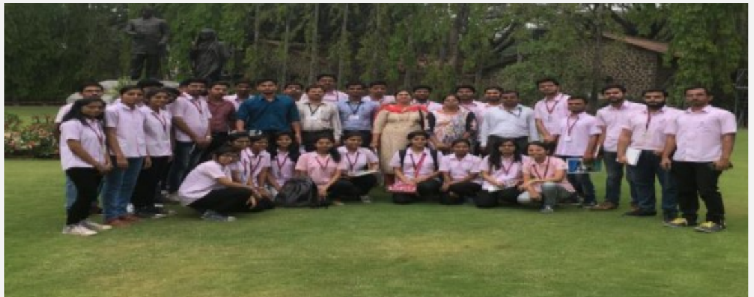
Students along with faculty members during the visit