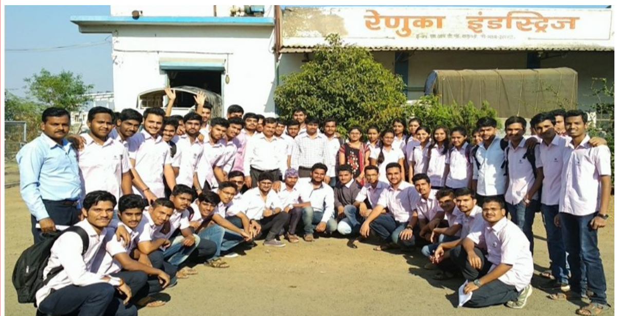
Students and faculty members during the visit to Renuka Ice Factory