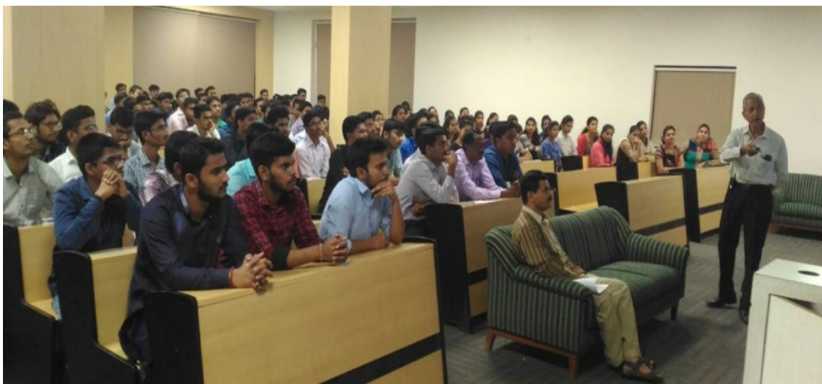
Students along with faculty members during Guest Lecture