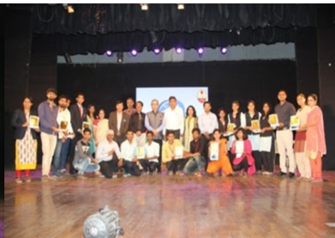
Winners of Water Olympiad 2018