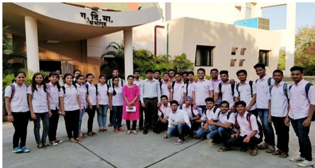
Students and faculty members during the visit