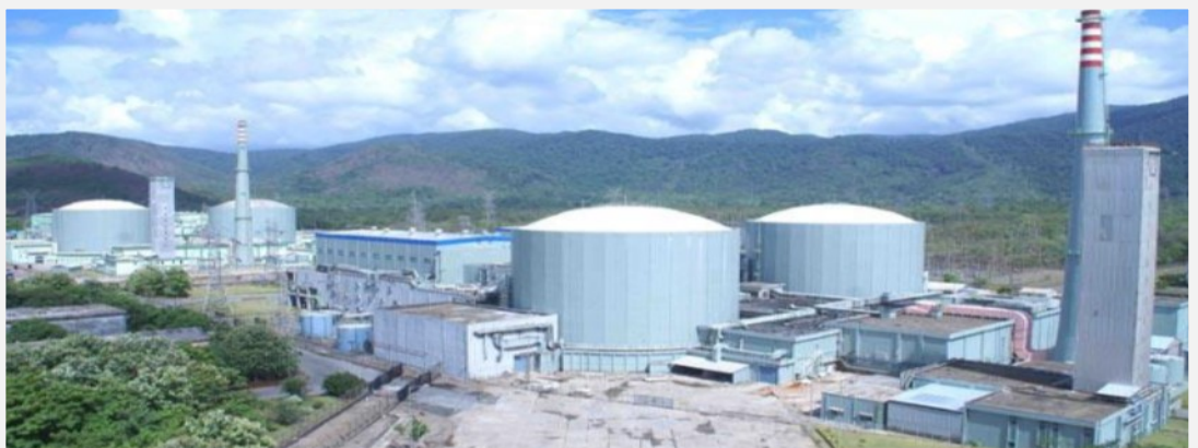
NPCIL Kaiga (Karnataka)