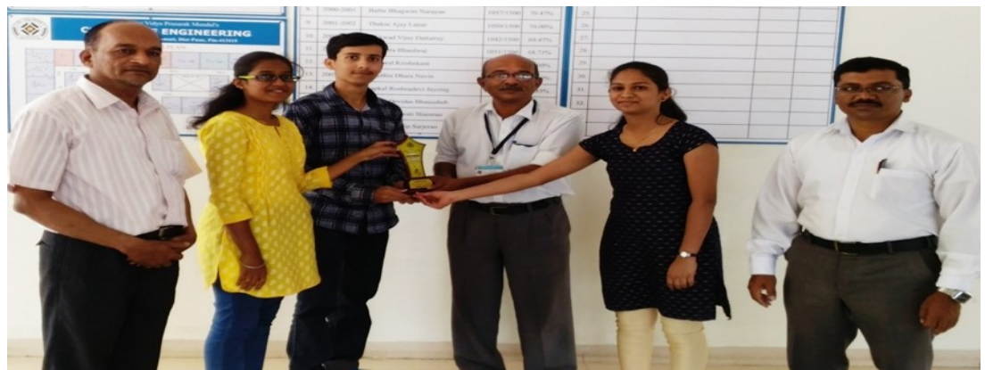
Students while receiving the Trophy during the Conference