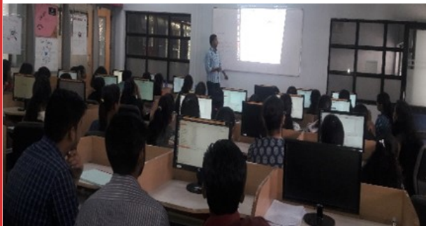
Students along with faculty members