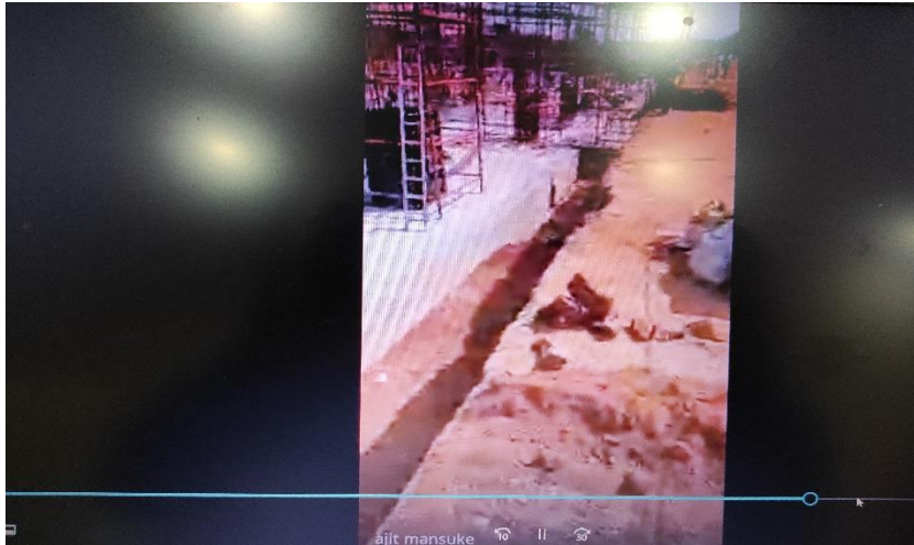
Fig 1: Ongoing construction activities on site