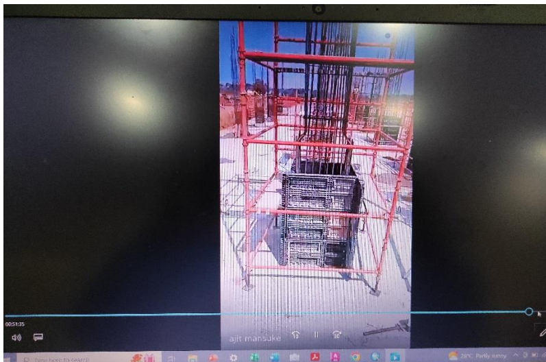
Fig 2: demonstration of new materials used on site